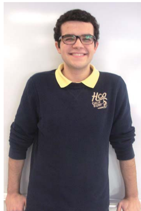
CABOCES Design & Print Publication